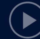
Primal rage KATERMUKKE