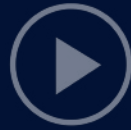
Acid Afternoon DYNAMIC MUSIC